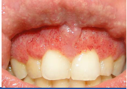
[Table/Fig-1]: Multiple exophytic pustules on the erythematous base that covered the gingiva and oral mucosa resembling "snail tracks". [Table/Fig-2]: Microscopic section revealed an intraepithelial clefting and inflammatory cells accumulation (eosinophilic microabscesses) ×100. [Table/Fig-3]: The oral lesions recurred as a result of drug discontinuation.